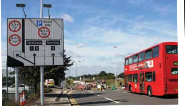
Part of the Heathrow application is to use signs to direct HGVs

The project involved the supply of UK Highways Agency-approved signs for the