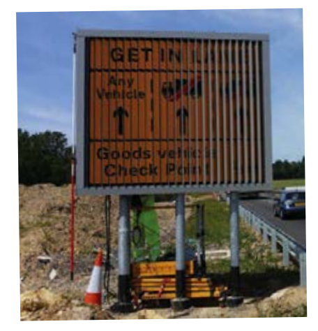
(Top) The 'get in lane' sign instructs goods vehicles to move into lane one (Above) The message can be changed by remote control

The UK currently has a directive in place to eliminate all foot traffic from its motorways and major 'A' roads. As a result, roadway signs that used to have their messages changed or flipped by hand now have to be remotely controlled.