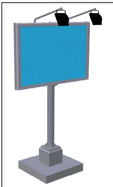
Single Sided XP

We look forward to answer any questions you might have regarding the complete Triplesign system.