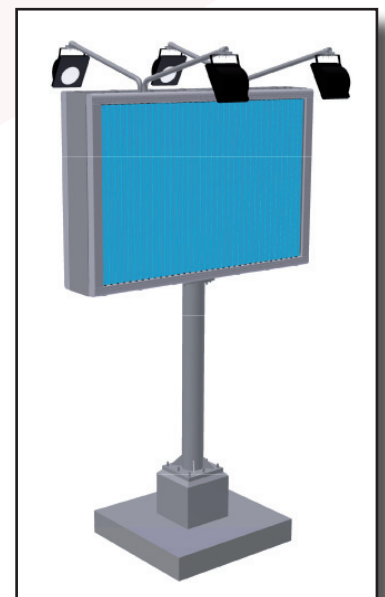
Double sided XP